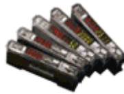
Fiber optic sensors